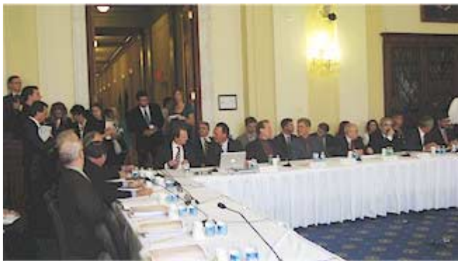
The Hearing about to begin

presentation was then backed with a 10-minute excerpt from Eric Huurre's powerful full-length documentary on the application of EFT with combat veterans, Operation Emotional Freedom . I noticed that several people had teared up and the combination of the compelling research data and the impact of seeing veterans who had been suffering with severe PTSD talking of their relief and sense of having been cured four days later set a powerful tone for the remainder of the meeting. We went on for more than two hours, discussing every aspect of the study, from the selection criteria to the strangeness of the method to the ethics of providing a treatment that makes it possible for people who are too damaged emotionally to be in combat to suddenly be able to be redeployed. By the end, the Lieutenant Colonel, who did not enter the meeting as a strong advocate of Energy Psychology, seemed to feel respectful of and supported by everyone in the room, enthused about the study, and ready to design it with greater confidence and sense of purpose.