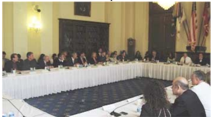
The Meeting Being Called to Order

felt – though the Amazon reviewers are mixed with 522 people giving it 5 stars as of today and 544 giving it 1 star, but I digress). More than 100 people crowded into the room, with the Committee and the invited guests sitting at a “round table” which was actually a rectangle made of 6 tables that seated 40 people shoulder to shoulder. Around the table were the Committee and 5 members of Congress not on the Committee who came in and out of the hearing, several high ranking administrative staff in the Veterans' Administration and the Department of Defense, and eighteen of us invited to talk about our “innovative treatments.” These included hyperbaric therapy chambers that can cost up to a million dollars each, virtual reality machines that recreate the combat experience for the purpose of intense exposure therapy, service dogs for victims of PTSD, the use of Omega 3 Fatty Acids, and a peer-support program where veterans help veterans. We had the quickest, cheapest best researched, and most effective method at the table.