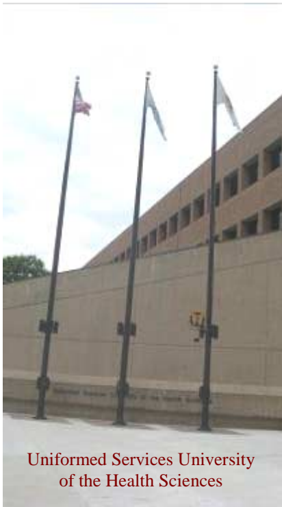
Uniformed Services University of the Health Sciences